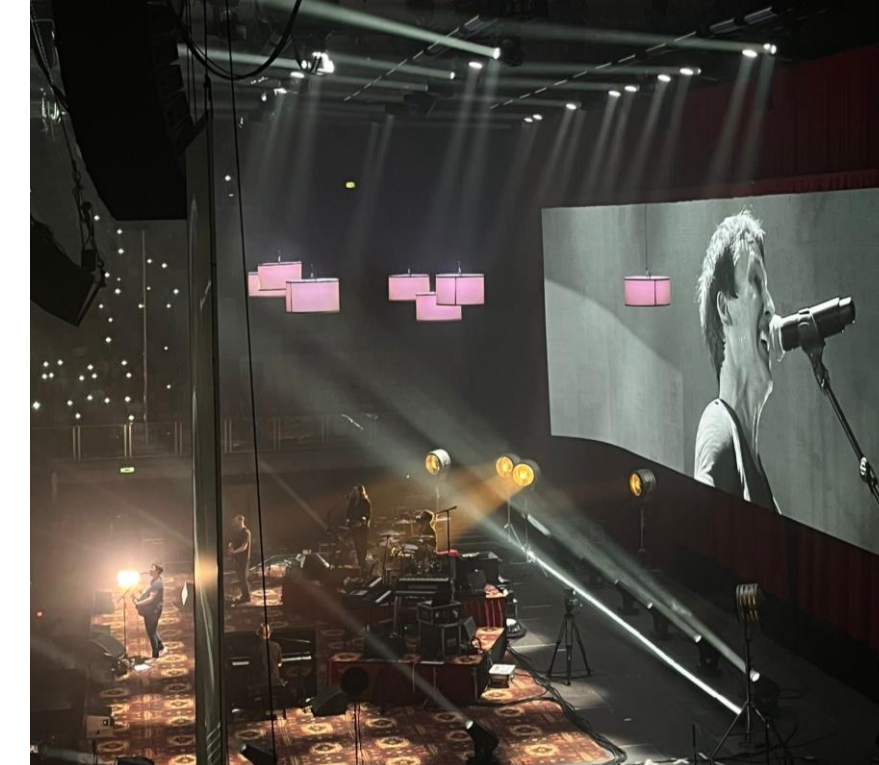
Figure 3.: JB_1 (1)