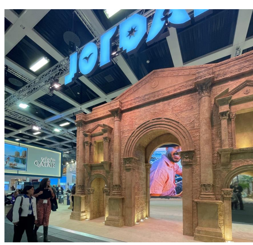
Figure 1.: ITB_1 (2)

Qualitative research using semi-structured photo elicitation interviews with 24 participants across four different events was conducted. Pictures were used to stimulate memory recall and facilitate detailed descriptions of sensory experiences.